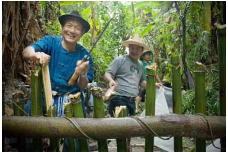
Community members in Nan Province, Northern Thailand, are working together to build a dam that will protect them from more frequent flooding in the area.

As part of our effort to build and share our knowledge in support of effective adaptation, CARE has undertaken a reflection process on vulnerability to climate change. This process draws on our experience working with vulnerable people around the world to reduce poverty and achieve social justice, supplemented by targeted analysis of vulnerability to climate change. This analysis was undertaken using the methodology described in the Climate Vulnerability and Capacity Analysis (CVCA)