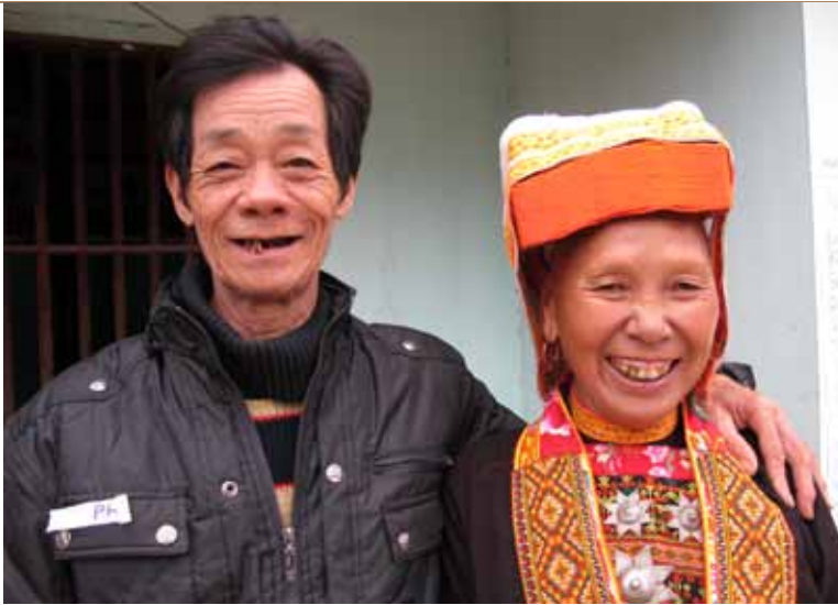
A couple from Na Ngoa Village who worked with CARE and its partners to contribute their ideas and perspectives during the CVCA process.

Most households practice subsistence agriculture, with major crops including rice, maize, cassava, sweet potatoes and taros. There is limited cultivation of soy beans, peanuts and a few fruits and vegetables. Most households also practice animal husbandry, raising pigs, poultry and fowl for food and sale. Cattles are raised to work the fields.