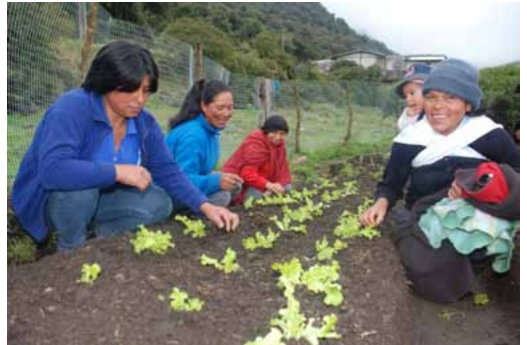
In 'El Valle del Tambo' valley in Papallacta, Ecuador, CARE is working with women farmers to protect their crops from increasing cold winds and frost.

These issues are critically important when vulnerability assessment will drive adaptation planning and resource allocation, such as in the development of National Adaptation Plans. Without identifying the most vulnerable people and ensuring that they have a voice in analysis and planning for adaptation, we run the risk that adaptation efforts will fail to benefit those who most need the resources and support.