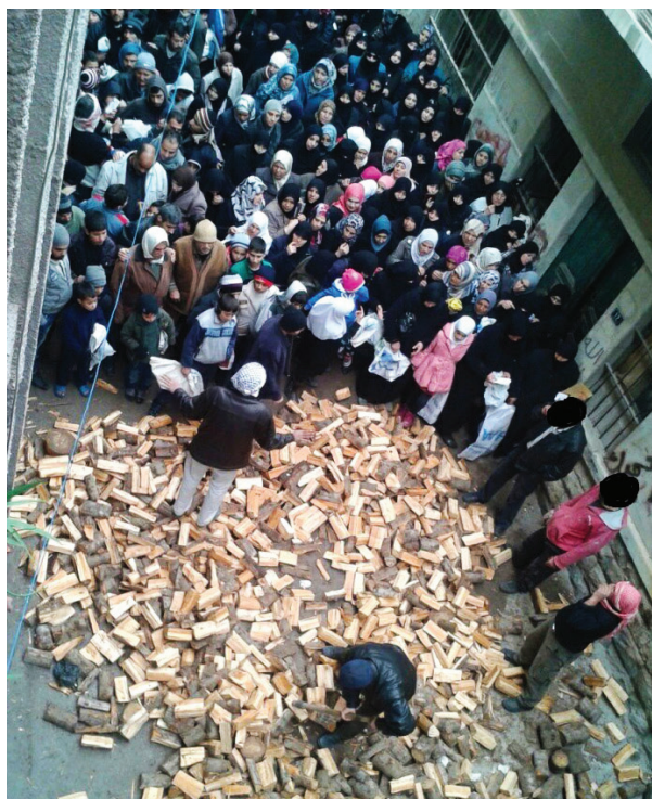
Above: Women gather at a firewood distribution point in southern Syria. Opposite Page: Men watching over children at a collective center for Syrian refugees in Saida, Lebanon, where CARE has provided families with cash assistance.